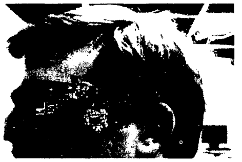
Figure 1. Eye-R system worn on a pair of glasses